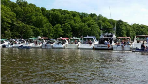
This is a picture from a previous year