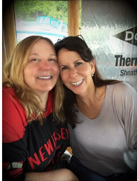
The Tiki bar is always a place for fun