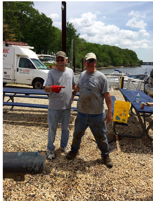
For those who remember, who is the BOLD one in this picture?