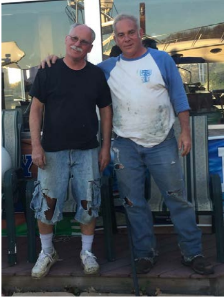
Only wear your best cloths when prepping your boat for the season.