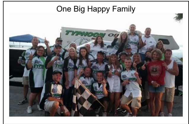
One Big Happy Family